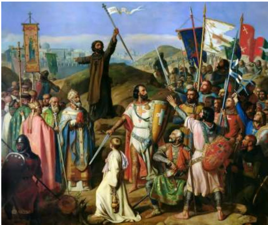
Figure 2 Depiction of Arnulf of Chocques (center) by Jean-Victor Schnetz

(Latin: Patriarchatus Latinus Hierosolymitanus ) is the Catholic episcopal see of Jerusalem, officially seated in the Church of the Holy Sepulchre. It was originally established in 1099, with the Kingdom of Jerusalem encompassing the newly territories in the Holy Land conquered by the First Crusade. From 1374-1847 it was a titular see, with the Patriarchs of Jerusalem being based at the Basilica di San Lorenzo fuori le Mura in Rome.