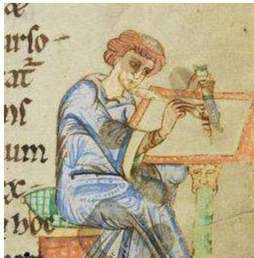
Figure 4 Depiction believed to be Raymond of Aguilers

After Roger of Salerno was killed in the Battle of Ager Sanguinis, King of Jerusalem Baldwin II placed Bernard at the head of the government of the Principality of Antioch.