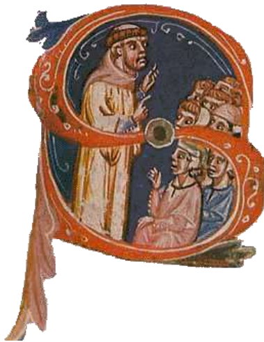
Figure 3 Fulcher of Chartres

He remained Patriarch until his death in 1118.