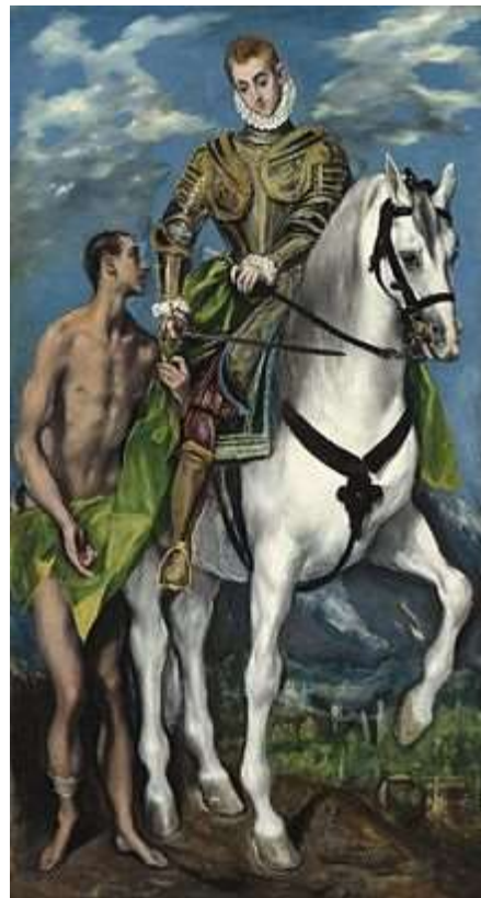
Figure 1 San Martín y el mendigo by El Greco, c. 1577–1579

This role has undertaken many forms as it evolved through history until it took a more organized form in the Roman Empire. It was here that Constantine conveniently converted to Christianity and served a dual office as emperor and head of the Roman state of religion in the name of pontifex maximus . These events