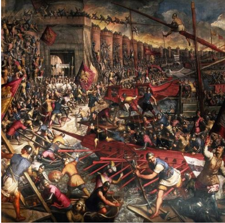
Figure 3 Venetians attacking the sea walls of Constantinople by Domenico Tintoretto

costs against the Crusaders and he seized the throne after executing his predecessors, father and son together, in January 1204. Constantinople's walls were strengthened, towers were heightened, and several raids made against the Crusader camps.