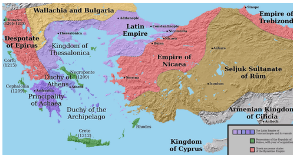
Figure 4 Byzantine Empire ca 1204

After the looting finally ended, the Partitio Romaniae treaty, already decided on beforehand, carved up the Byzantine Empire amongst Venice and its allies. The Venetians took three-eighths of Constantinople, the Ionian islands, Crete, Euboea, Andros, Naxos, and a few strategic points along the coast of the Sea of Marmara. Thus, Venetian control of Mediterranean trade was now almost total. On May 9, 1204, Count Baldwin of Flanders was made the first Latin Emperor of Constantinople (r. 1204-1205) and crowned in the Hagia Sophia, receiving five-eighths of Constantinople and one-quarter of the Empire which included Thrace, northwest Asia Minor, and several Aegean islands. Boniface of Montferrat took over Thessalonica and formed a new kingdom there, which also included Athens and Macedonia. In 1205, following Baldwin's capture after a battle with the Bulgars defending his territory in Thrace and subsequent death in a Bulgarian prison, William I Champlitte and Geoffrey I Villehardouin (nephew of the historian of the same name) founded a Latin principality in the Peloponnese while the French duke Othon de la Roche grabbed Attica and Boeotia.