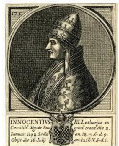
Figure 1 Pope Innocent III

The Third Crusade, although achieving some notable military successes, had failed completely in its original objective of recapturing Jerusalem from the Muslim Sultan of Egypt and Syria, Saladin. The celebrated Sultan was now dead, but the Holy City remained in Muslim hands. Yet another crusade was required. The Fourth Crusade was thus called for by Pope Innocent III (r. 1198-1216) in August 1198. As previously, those who went to the Holy Land and fought the infidels would receive a remission of their sins, but as an added incentive, Innocent III now extended this 'benefit' to those who gave the necessary money to fund a warrior to go in their stead.