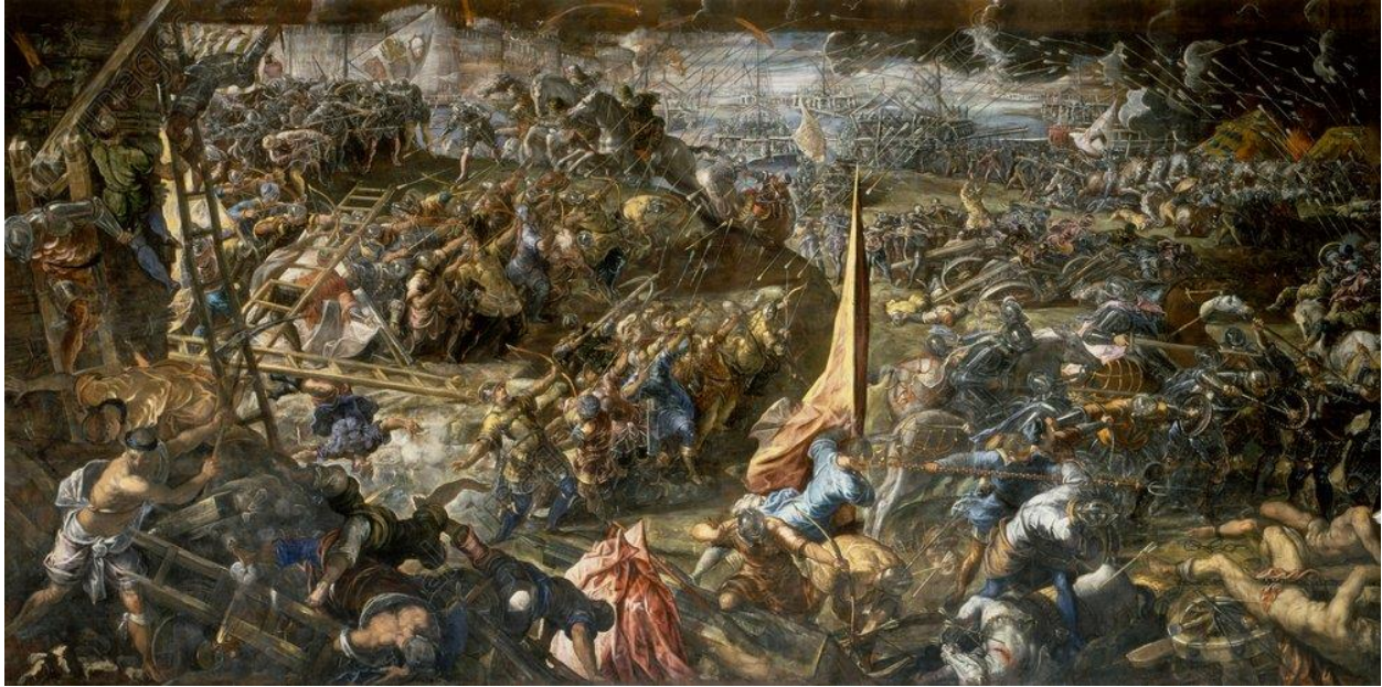
Figure 2 Battle of Zara by Jacopo Robusti

In 1202, Pope Innocent III, despite wanting to secure papal authority over Byzantium, forbade the crusaders of Western Christendom from committing any atrocious acts against their Christian neighbors. However, this letter was concealed from the bulk of the army who arrived at Zara on November 10-11, 1202, and the attack proceeded. The citizens of Zara made reference to the fact that they were fellow Catholics by hanging banners marked with crosses from their windows and the walls of the city, but nevertheless the city fell on November 24, 1202 after a brief siege. There was extensive pillaging, and the Venetians and other crusaders came to blows over the division of the spoils. Order was achieved, and the leaders of the expedition agreed to winter in Zara, while considering their next move. The fortifications of Zara were demolished by the Venetians.