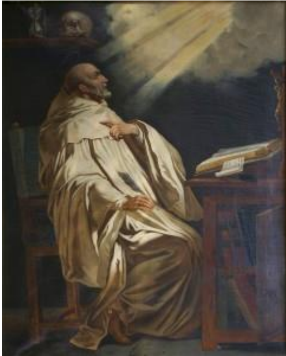
Figure 1 Bernard of Clairvaux d'après Philippe de Champaigne by François Vincent Latil

Bernard of Clairvaux , O.Cist (1090 –August 20, 1153) was a French abbot and a major leader in the reform of Benedictine monasticism that caused the formation of the Cistercian order. Bernard's parents were both members of the highest nobility of Burgundy. Bernard was the third of seven children, six of whom were sons. At the age of nine years, he was sent to a school at Châtillon-sur-Seine run by the secular canons of Saint-Vorles. Bernard had a great taste for literature and devoted himself for some time to poetry. His success in his studies won the admiration of his teachers. He wanted to excel in literature in order to take up the study of the Bible. He had a special devotion to the Virgin Mary, and he later wrote several works about the Queen of Heaven.