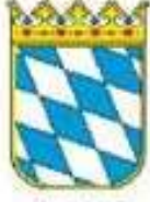
Arms of Bavaria