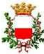
Arms of Lucca