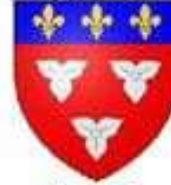
Arms of Orleans