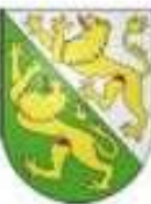
Arms of Thurgau