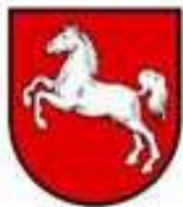
House of Welf