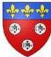
Arms of Chartres