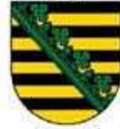
Arms of Saxony