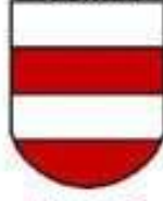
House of Hohenberg