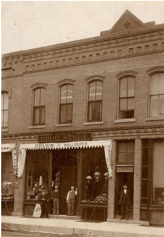
Jensen Drug Store