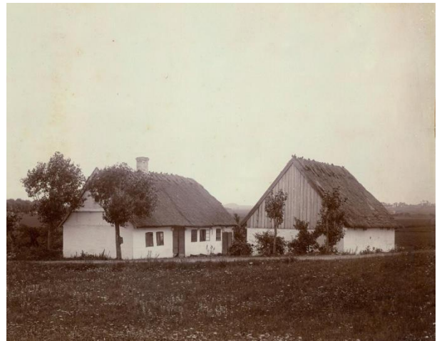
Jensen Home in Denmark