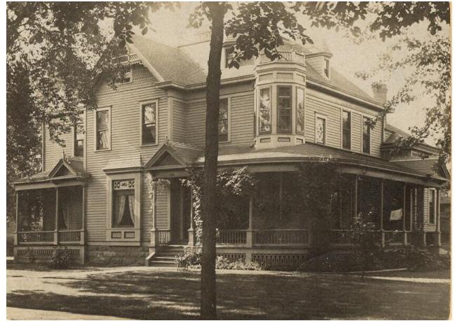
Jensen Home in Albert Lea, MN

In 1900 he sold out and retired. He owned three stores on West Clark street, in Albert Lea and spent his time looking after his various real estate and other holdings. He owned 480 acres of farm land in North Dakota, was a stockholder and director in the Citizen's National Bank of Albert Lea, a director in the Albert Lea Land Co., and a director in the Madison Valley Land and Stock Co., of Albert Lea, which latter he helped to organize.