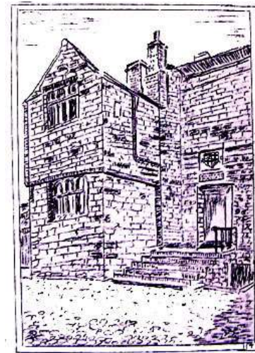
Across the road from Cliburn Hall is the Parish Church of Cliburn, a Norman structure built in the twelfth century.