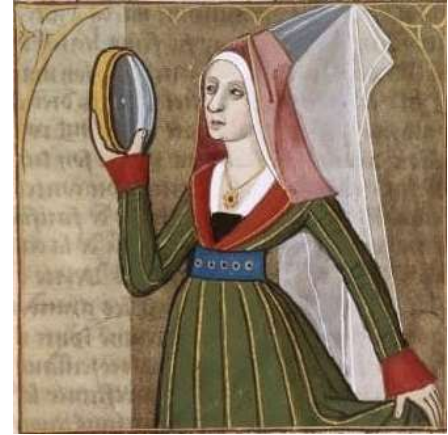
Figure 1 15th century woman holding a mirror

The Romans believed that breaking a mirror was bad luck and it was punishable by seven years of bad luck. The Romans believed that life came in seven year cycles and therefore breaking a mirror would mean that a person would have to wait to be renewed after seven years. Some beliefs held that if a person was ill they could break a mirror and suffer the seven years bad luck, after which they would be renewed and healthy again.