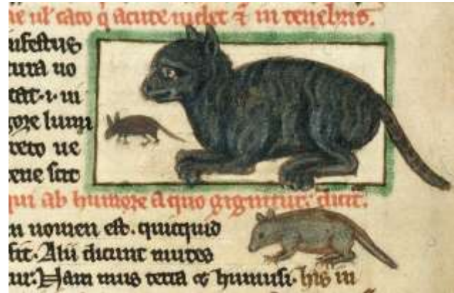
Figure 15 Medieval depiction of a black cat

Heretical religious groups, such as the Cathars and Waldensians, were accused by Catholic churchmen of associating and even worshipping cats. When the Templars were put on trial in the early fourteenth-century, one of the accusations against them was allowing cats to be part of the services and even praying to the cats. Witches too, were said to be able to shape-shift into cats, which led to Pope Innocent VIII declaring in 1484 that "the cat was the devil's favourite animal and idol of all witches."