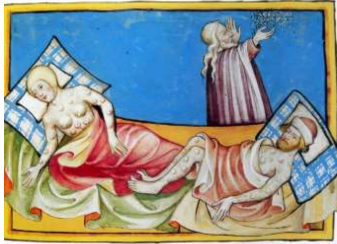
Figure 10 Representation of the plague

But ordinary, common folk could not comprehend such sophisticated ideas. They would rather believe that the plague was a punishment from God, and was a portent of the end of the world. Plague legends tried to explain how the disease spread—the best known one is the Austrian legend of the Pest Jungfrau, or the Pest Maiden. She was imagined as a being