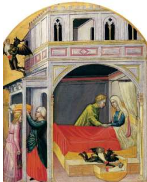
Figure 5 The Devil steals a baby and leaves a changeling. Martino di Bartolomeo (early 15th century)

Some scholars have suggested that changelings may have been used as a way to explain autistic children, especially since the changes can come on quickly. When a child's behavior and verbal skills rapidly declined or changed, it was blamed upon the doings of the changeling.