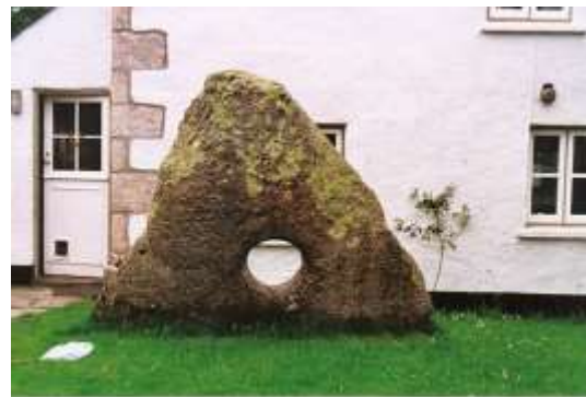
Figure 13 Tolvan holed stone.

The triangular Tolvan holed stone is an unusually shaped, roughly triangular, megalith in Cornwall, England, behind the farmhouse at Tolvan Cross. The stone is reputed to possess healing powers. In particular, according to the legend, it guarantees fertility to the newly married - but only if the partners squeeze naked through the hole.