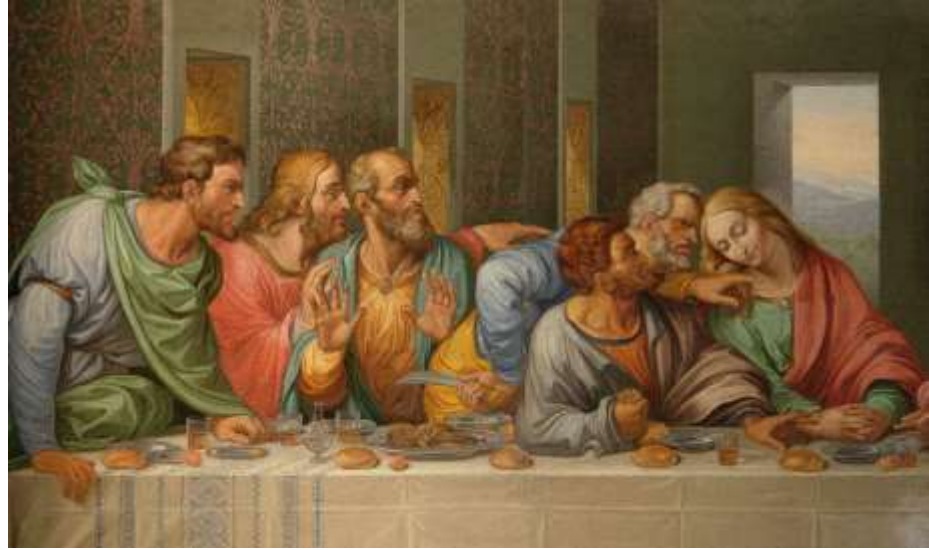
Figure 4 Detail of the Last Supper which shows Judas spilling the salt

People who are described as 'the salt of the earth' are those who are considered to be of great worth and reliability. The phrase 'the salt of the earth' derives from the Bible, Matthew 5:13 (King James Version): Ye are the salt of the earth: but if the salt have lost his savour, wherewith shall it be salted? It is thenceforth good for nothing, but to be cast out, and to be trodden under foot of men. The positivity towards salt in this phrase conflicts with many other uses of the word salt, which has also been used express negative concepts; for example, in the Middle Ages, salt was spread on land to poison it, as a punishment to landowners who had transgressed against society in some way. It seems that the 'excellent' meaning in 'the salt of the earth' was coined in reference to the value of salt. This is reflected in other old phrases too, for example, the aristocratic and powerful of the earth were 'above the salt' and valued workers were 'worth their salt'. 'The salt of the earth' was first published in English in Chaucer's Summoner's Tale , circa 1386, although Chaucer undoubtedly took his lead from Latin versions of the Bible.