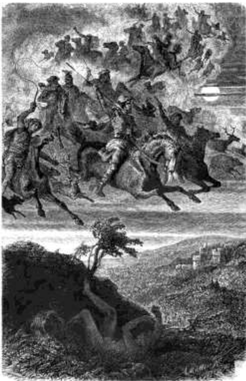
Figure 9 Norse depiction of a Wild Hunt

but not before fencing him in with nets. Despite their precautions, the merman managed to break through the nets and escape, amazing the onlookers with his agility in the water. The creature did return to his captors, but escaped again after two months, never to be seen again.