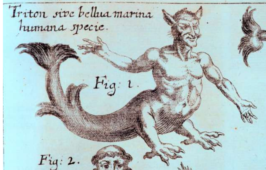
Figure 8 Depiction of the Wild Man of Orford

but not before fencing him in with nets. Despite their precautions, the merman managed to break through the nets and escape, amazing the onlookers with his agility in the water. The creature did return to his captors, but escaped again after two months, never to be seen again.