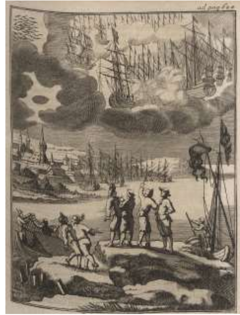
Figure 7 Illustration of Magonia

They could apparently strike deals with the “storm-makers,” and the grain and other crops that fell in these storms were gathered by the “aerial sailors” and taken back to Magonia. Agobard was skeptical, calling such beliefs “foolishness” and the people who subscribed to them “crazy.” Nevertheless, a mob of locals claimed to have captured four beings—three men and a woman—who had apparently fallen from one of the ships. They kept the captives in chains for some days. The angry mob was itching for a lynching, and they brought the prisoners to Agobard, who, being more given to reason, pronounced them innocent and let them go.