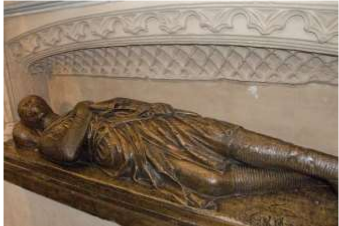
Figure 12 Wooden effigy of a knight in Southwark Cathedral