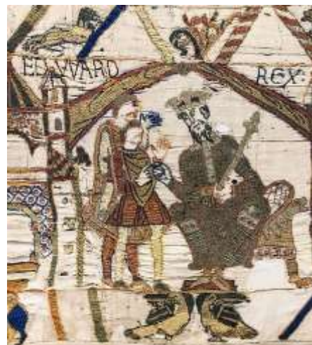
Figure 3 Edward the Confessor as shown on the Bayeux Tapestry

French tradition, on the other hand, has King Philip I initiating it in the 11th century. In medieval times, grand ceremonies were held in which the ruler touched hundreds of people afflicted with scrofula, or the “King’s Evil.” These people then received special gold coins called “touch pieces” that they regarded as amulets. By the 1400s, there was also the custom of healing through touching a coin called an angel, which in turn had been touched by the monarch.