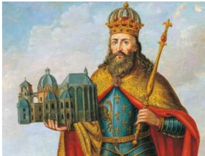
Figure 6 Charlemagne and his basilica

The Frankish king Charlemagne was crowned Holy Roman Emperor in A.D. 800. In the last three years of his life, according to his biographer, Einhard, the Emperor was bedeviled by sinister signs and omens. Einhard reports of frequent eclipses of the Sun and Moon, and a black spot on the Sun which lasted seven days. There were also frequent trembling at the palace at Aix-la-