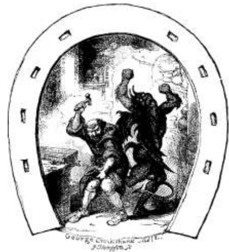
Figure 2 Representation of Dunstan and the Devil

There are a few reasons why people of the Medieval period believed that horseshoes were lucky. The first was that they were made of iron, a metal that was long believed to ward off evil spirits. The other reason comes from the legend that is told about Saint Dunstan in the 10th century. It was said that that Dunstan worked as a blacksmith and one day the Devil came into his shop. Dunstan pretended not to recognize him and went about getting horseshoes for the Devil's horse.