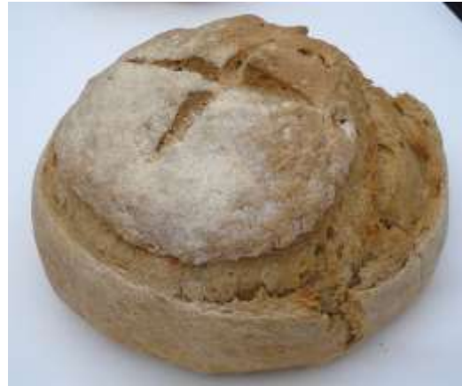
Figure 14 Medieval wedding cake

In Roman times, the wedding cake was made from wheat, fruit, nuts and honey – symbols of wealth and fertility. The cake was broken over the bride’s head to ensure a fertile and prosperous marriage, and the guests scrambled to pick up the crumbs of good luck, which is why even today small pieces of wedding cake are sent to guests who can’t attend.