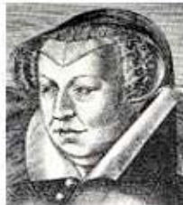
Catherine de Medici

It was Catherine de Medici who persuaded her weakling son Charles IX to order the mass murder, which lasted three days and spread to the countryside. On Sunday morning August 24th, 1572 she personally walked through the streets of Paris to inspect the carnage.