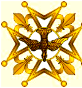
The order decoration of the Order of the Holy Spirit (Chevaliers du Saint-Esprit) which Henry III established in 1578.

Turks. They lived for 4 centuries on the island of Malta, hence the name Maltese Cross for the central part. (The Maltese Cross is generally associated with fire and is the symbol of protection of fire fighters in many countries).