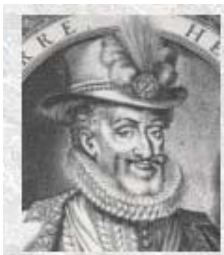
King Henry IV

Henry of Navarre's life was spared when he pretended to support the Roman Catholic faith. In 1593 he made his "perilous leap" and abjured his faith in July 1593, and 5 years later he was the undisputed monarch as King Henry IV ( le bon Henri , the good Henry) of France.