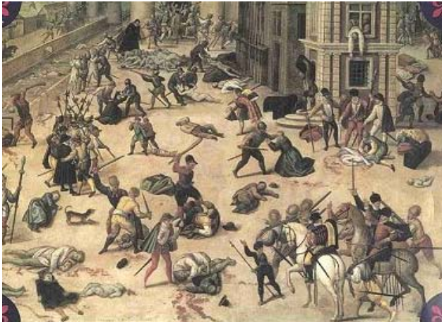
St. Bartholomew massacre, 1572

The Huguenots transformed themselves into a definitive political movement thereafter. Protestant preachers rallied a considerable army and a formidable cavalry, which came under the leadership of Admiral Gaspard de Coligny. Henry of Navarre and the House of Bourbon allied themselves to the Huguenots, adding wealth and holdings to the Protestant strength, which at its height grew to sixty fortified cities, and posed a serious threat to the Catholic crown and Paris over the next three decades.