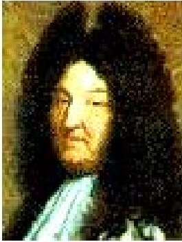
King Louis XIV

With the proclamation of the Edict of Nantes, and the subsequent protection of Huguenot rights, pressures to leave France abated, as did further attempts at colonization.