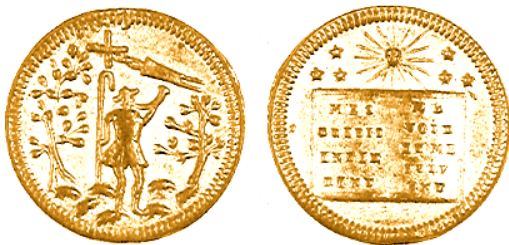
Front- and back of the Méreau used by the Church of l'Agenais, 16th century. The front depicts Christ, dressed as a shepherd tending his flock.

In approximately 1561 Calvin wrote a " letter to the faithful in France " in which he strongly urged them to use the méreaux . The use of such an attendance token consequently became common practice and for more than 200 years it served as a token of adherence to the persecuted religion and its rites as well as a secret symbol of the solidarity of the faithful.