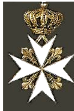
The badge of the Russian division of the Order of the Knights of St John of Jerusalem, Hospitalers.

after the collapse of the Crusader states, and in 1530 formed the order of the Knights of Malta after Rhodes was surrendered to the Ottoman