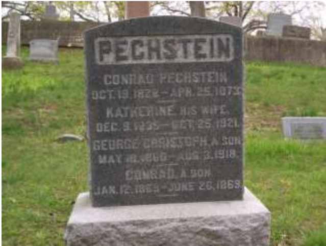
From History of Lee County Iowa The S.J. Clarke Publishing Co. 1914, Vol II, pg 168-169