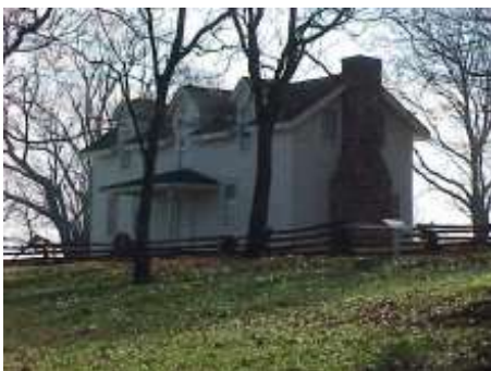
Borden House on the Prairie Grove Battlefield

Seeing the effect of his artillery, Herron ordered an advance on the hill rather than waiting for Blunt to arrive. His troops first encountered Confederate cavalry in the Borden wheatfield at the base of a ridge overlooking the prairie. Herron took these advanced troopers to mean that Hindman was planning to attack and capture the Union artillery. So Herron sent forward two regiments from his own 3rd Division to assault a Confederate battery near the Borden house. When his men arrived on the hill they found themselves under a fierce Confederate counterattack from three sides by Marmaduke and Brigadier General Francis A. Shoup. Half of the attacking Federals were wounded or killed within minutes, most near the Borden House.