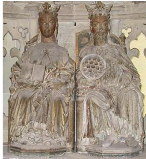
Edith and Otto

Edith died 26 January 946. Her tomb is located in the Cathedral of Magdeburg; a lead sarcophagus with her name on it was found and opened in 2008 and is currently (as of 2009) being examined.